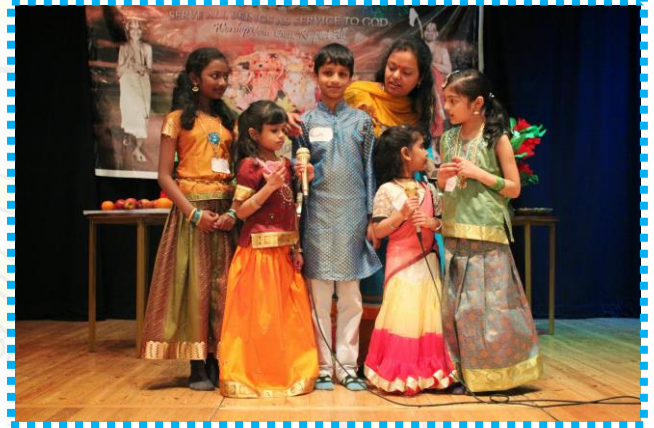
Kids singing the devotional songs and reciting the shlo:ka:s.