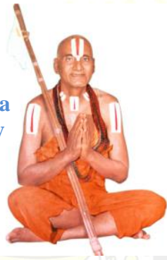
Sri Chinna Srimannarayana Ramanuja Jeeyar Swamy