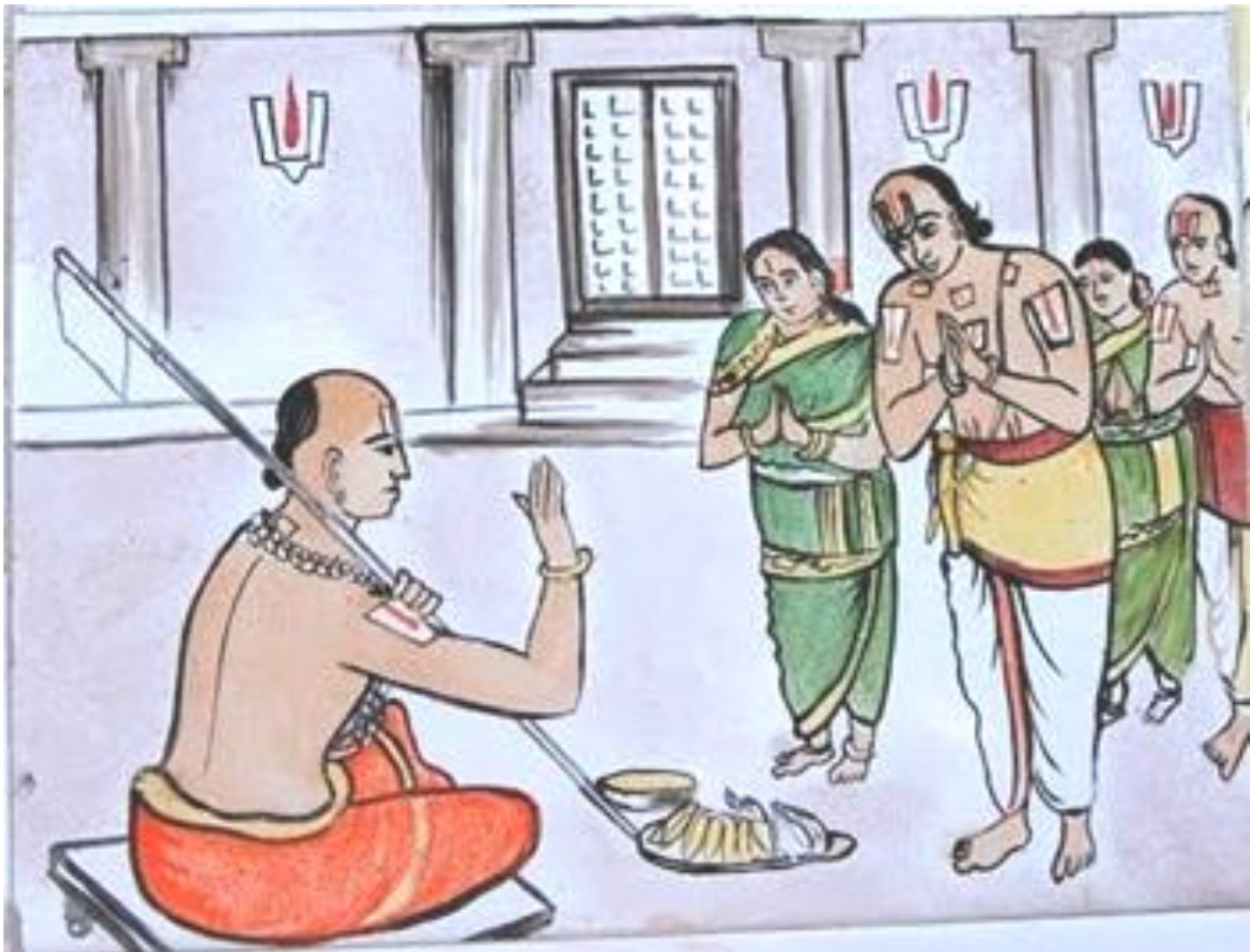
Ananthalwan and his wife praying to their guru Bhagavad Ramanuja

Ananthalwan was born in 1053 AD in a place called Siruputtur, near the southern town of Mysore in India. He was interested in learning Vedas and scriptures and studied them from a very young age. He became a disciple of Bhagavad Ramanujacharya and spent his time performing service to his teacher.