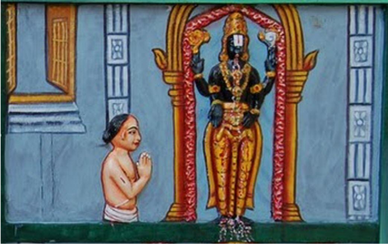
Ananthan sees Lord bleeding

He asked the priests to apply camphor, or paccha karpooram, on his chin so that the bleeding would stop and provide relief to the Lord. Ever since then, the priests of Tirumala have applied a white camphor to Lord Srinivasa's chin as a beauty spot.