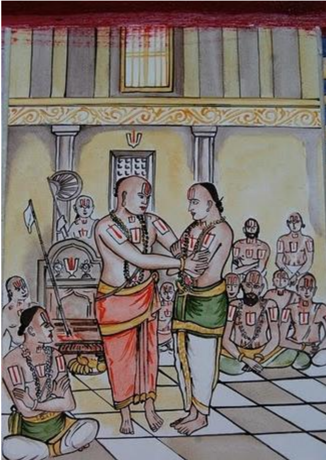
Anantharya , You are truly THE MAN (Aanpillai in Tamil)

Ramanuja felt very happy. He stood up and hugged Anantharya and declared before the gathering, “Anantharya , You are truly THE MAN (Aanpillai in Tamil).”