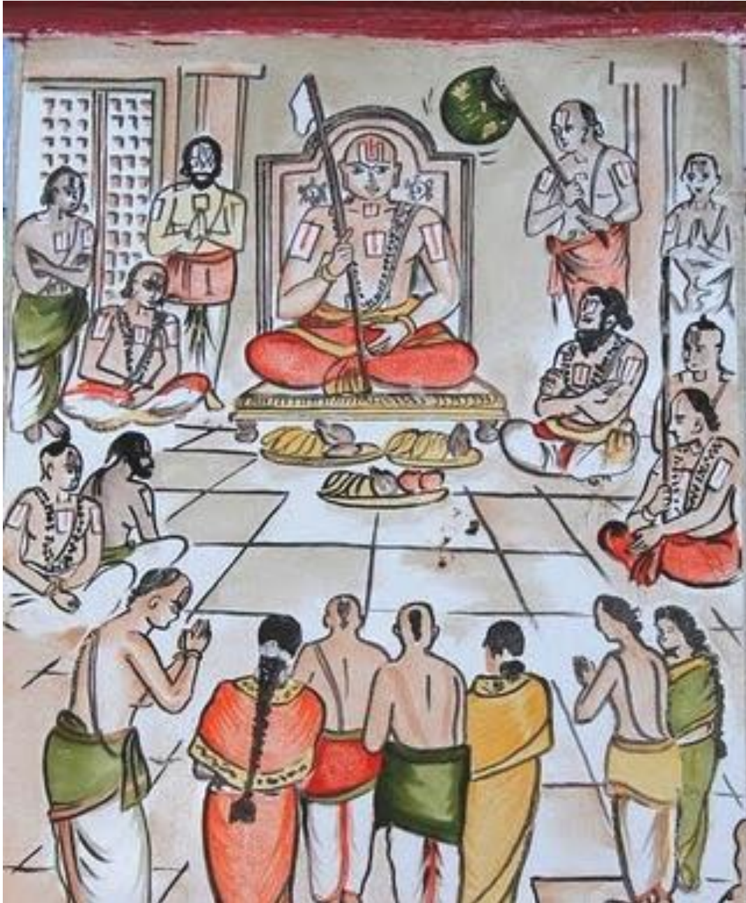
Bhagavad Ramanuja asking the gathering "Who can go to Tirumala to serve the Lord?"

Bhagavad Ramanuja's guru Tirumala Nambi lived in Tirumala Hills serving Lord Srinivasa. However, he was getting old and found it hard to maintain the temple and its surroundings. Ramanuja, who was inspired by Alvars's (saints immersed in deep devotion to the Lord) divine poems on Lord of Seven Hills, called an assembly of Acharyas, and asked them if any them would undertake the task of serving the Lord on the Hills every day.