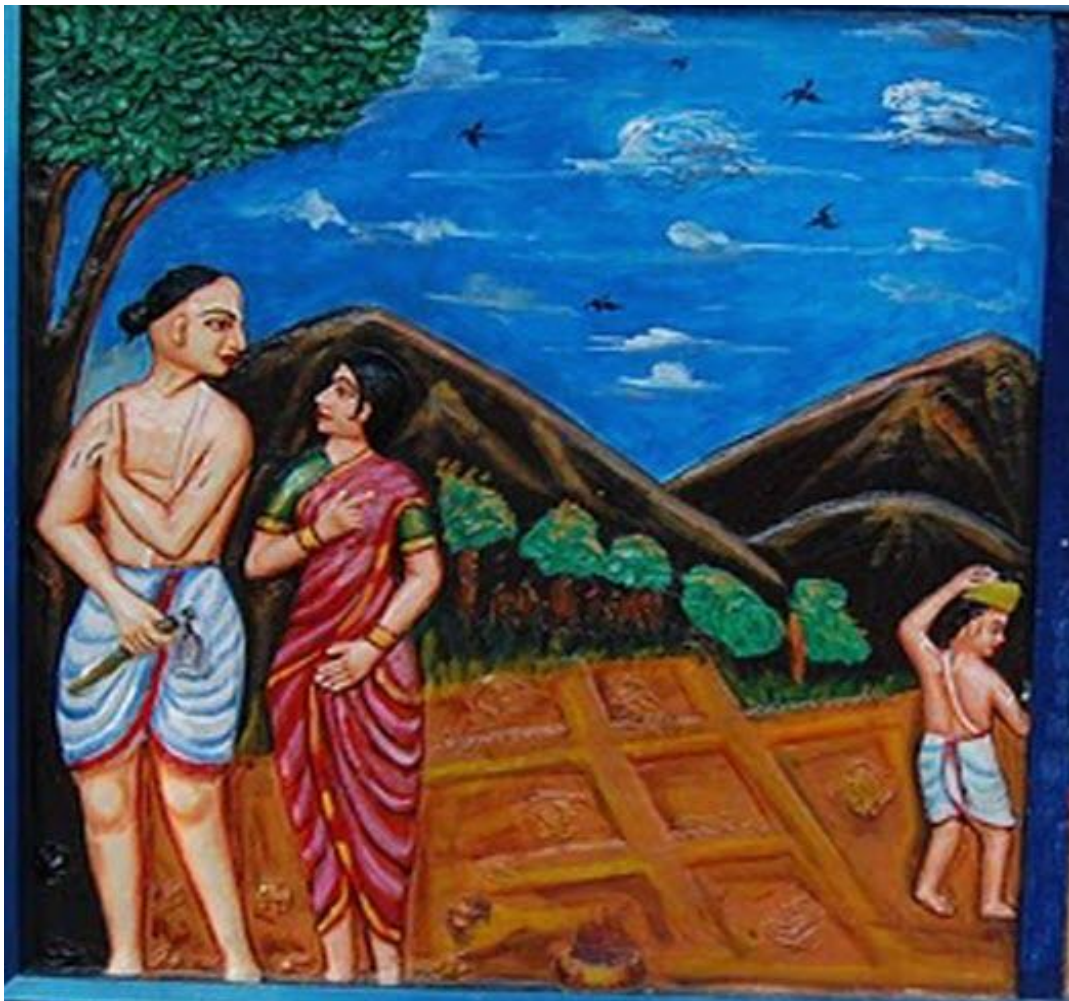
Wife shows Anathalwan the boy and says, "That young boy is helping us"

She returned with the empty basket within few moments. Ananthalwan became curious when he noticed his wife was returning much more quickly with the